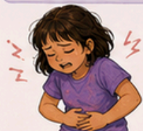
Pain or cramps