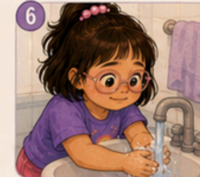
6 Rinse well with clean water and dry your hands.