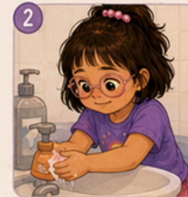
2 Take soap and rub your hands together.