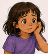
Any discharge, irritation or rashes