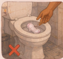
Don't flush the pad in the toilet.