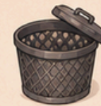
A bin to throw away the used pad