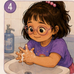
4 Rub between your fingers.