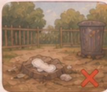
Don't throw the pad in open places.