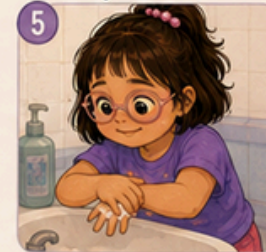
5 Rub the back of your hands and your thumbs.