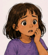
Hair fall, acne or other body changes