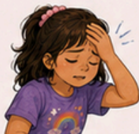
Mood changes or feeling low