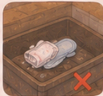
Don't leave the used pad anywhere.

These things are not safe, not clean, and not respectful. ❤️