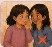
Don't show or talk about it in public.