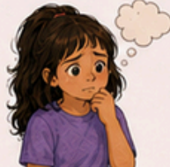
Late or missed periods