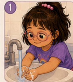
1 Wet your hands with clean water.