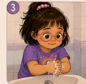
3 Rub your palms together.