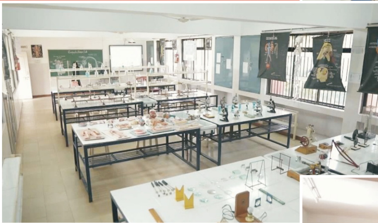
COMPOSITE SCIENCE LAB