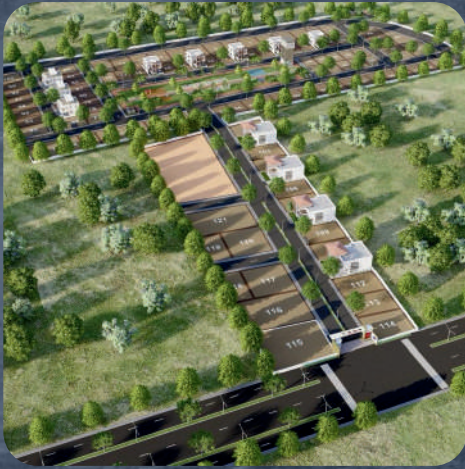
Layout Ariel View