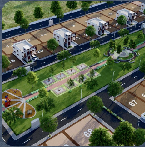
Centrall Landscaped Area