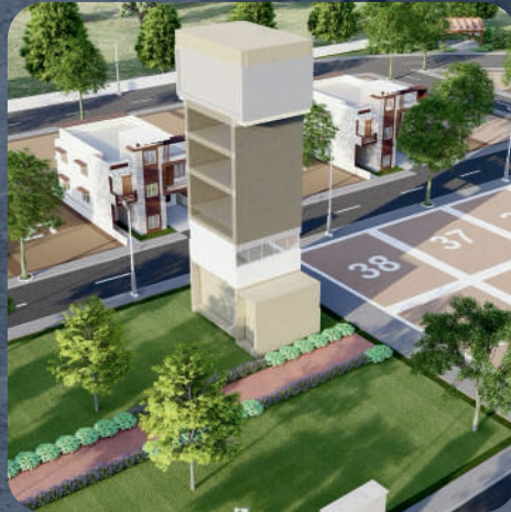
Water Tank With Sump