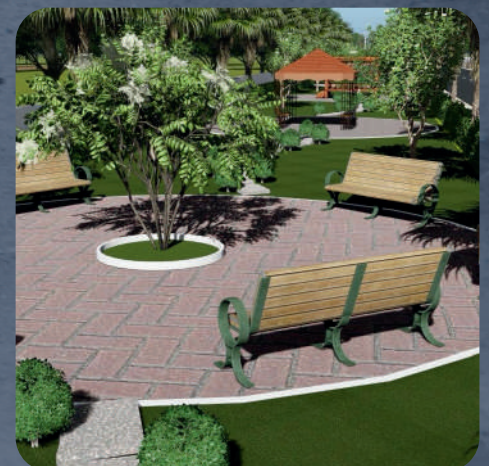
Elders Sitting Area